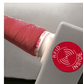
YRS® - Our proprietary system to protect the customer quality standard through RFID technology

The machine has 3 preset programs, enabling fast and easy changing of button wrap options complemented with button wrap sequence programming (SP). The proven Ascolite YRS Yarn Recognition System assures the best results in button shank wrapping.