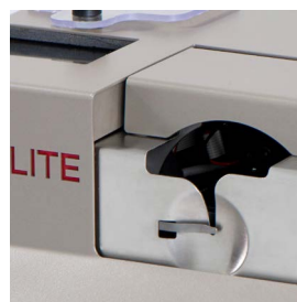
Automatic threading. Unique high speed threading of machine for simple and fast change of colours