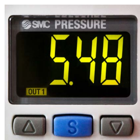
Air pressure digital meter to prevent the malfunctioning of the machine during operation