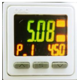
Air pressure digital meter to prevent the malfunctioning of the machine during operation