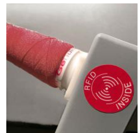
YRS® - Our proprietary system to protect the customer quality standard through RFID technology