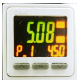
Air pressure digital meter to prevent the malfunctioning of the machine during operation