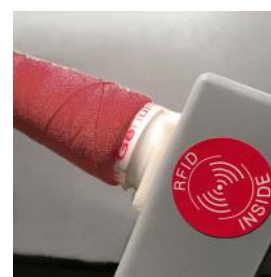
YRS® - Our proprietary system to protect the customer quality standard through RFID technology