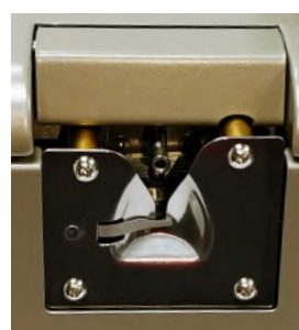
Automatic threading paired with unique Yarn Monitor Switch (YMS)